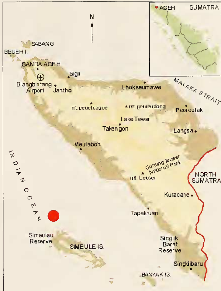
Figure 1. Map of Aceh Province, Sumatra, Indonesia illustrating expedition itinerary 17-31 October 2005. Numbers represent site numbers as defined in Table 1. Red dot indicates approximate December 26, 2004 earthquake epicenter.